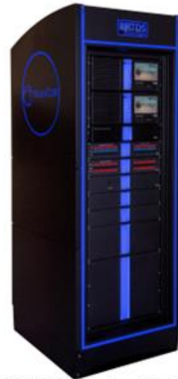
RTDS NovaCor Cubicle